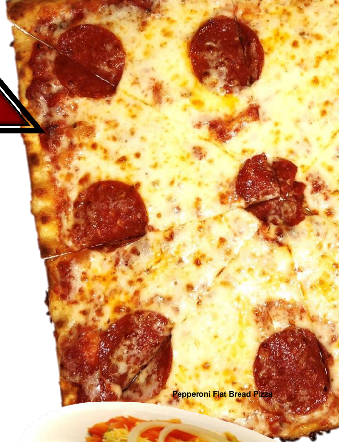
Pepperoni Flat Bread Pizza