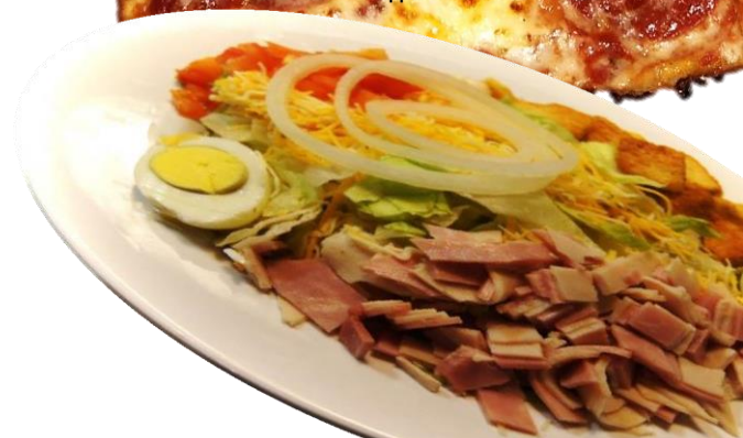
King Chef Salad